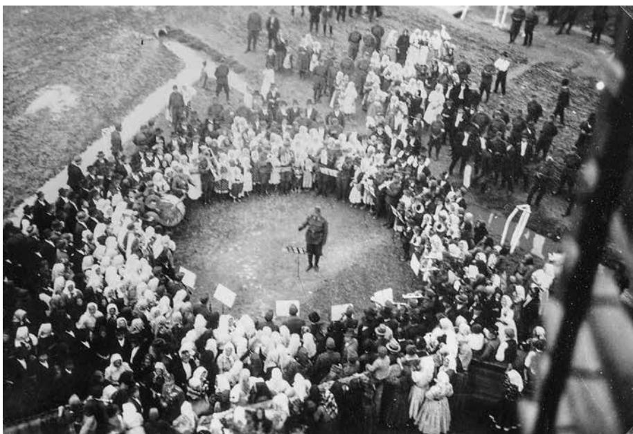
Figure 3. Concert of Hungarian army band at the main square of Szilágypercse