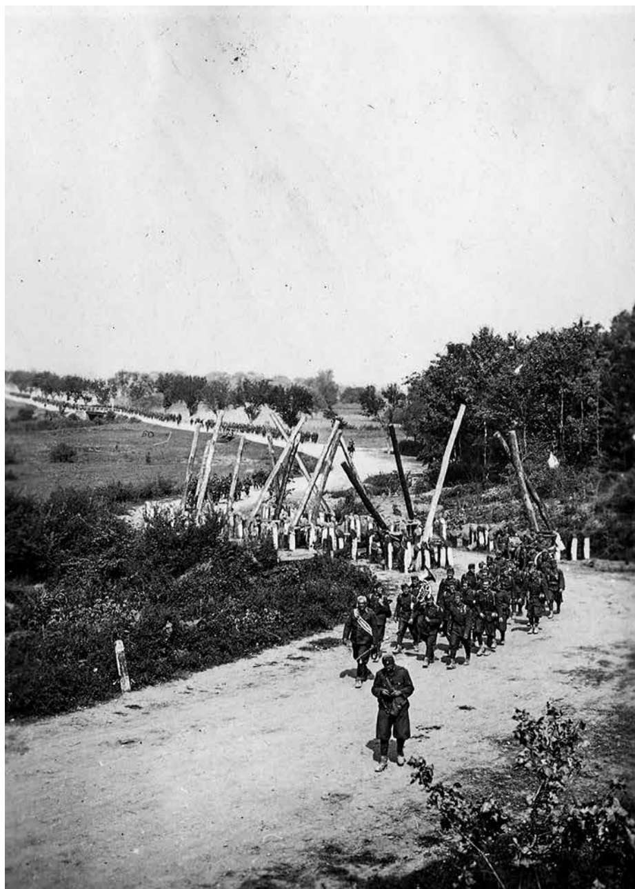
Figure 2. The band of the 2 nd Infantry Regiment at the roadblocks in front of Hadad, on 7 September 1940.