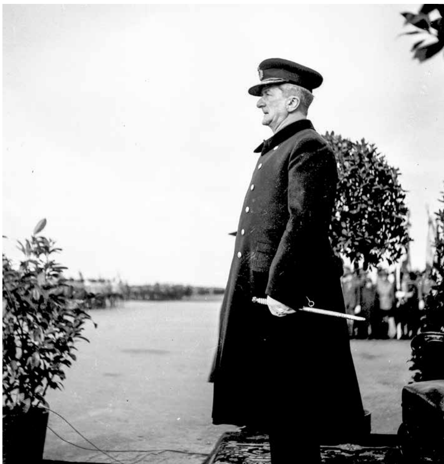
Figure 2. Miklós Horthy in April 1938 at the airport of Budaörs, when the 25th anniversary of the Hungarian Scouting was celebrated.