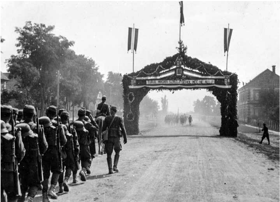
Figure 1. The 32 nd Infantry Regiment at Vállaj, on 5 September 1940.