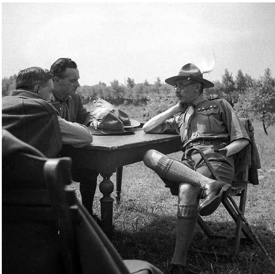
Figure 1. Pál Teleki on the jamboree organized in Gödöllő in 1933.